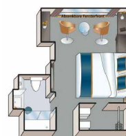
Suite (284 sq ft)