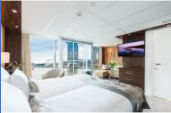
Suite with walk-out exterior balcony