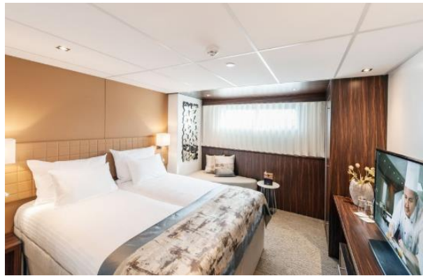
Haydn Cabin with panoramic window

Contact your Travel Agent to reserve your cabin today!