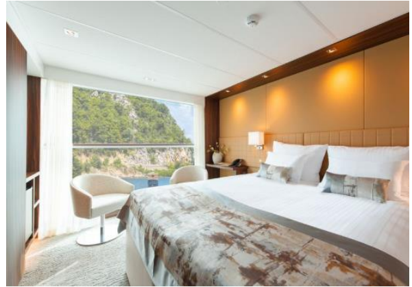
Strauss Cabin & Mozart Deck with drop-down panoramic window